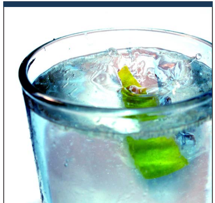
Try adding fresh lemon or lime juice for a splash of flavor in your water.