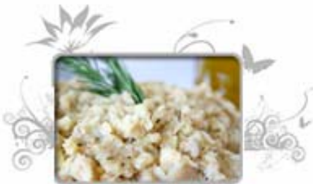
Mashed White Beans with Roasted Garlic and Rosemary

In a large skillet heat olive oil over medium-low heat. Add whole garlic cloves and rosemary sprig. Sauté until garlic is soft and rosemary is crispy. Smash garlic with the back of a wooden spoon. Remove rosemary, slide off the leaves and mince them; return to skillet. Add beans and heat through, stirring and drizzle with additional olive oil. Serve hot. Makes 6 Weight Loss Surgery servings.